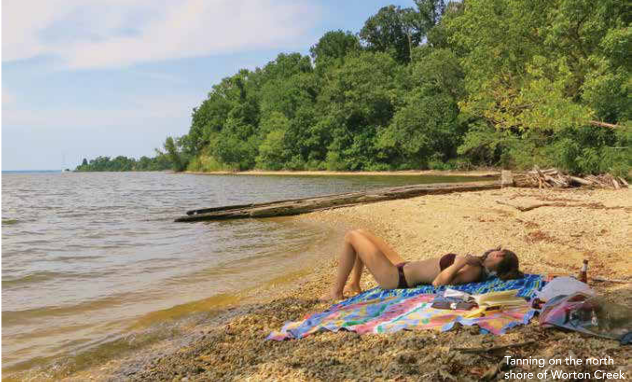
Tanning on the north shore of Worton Creek