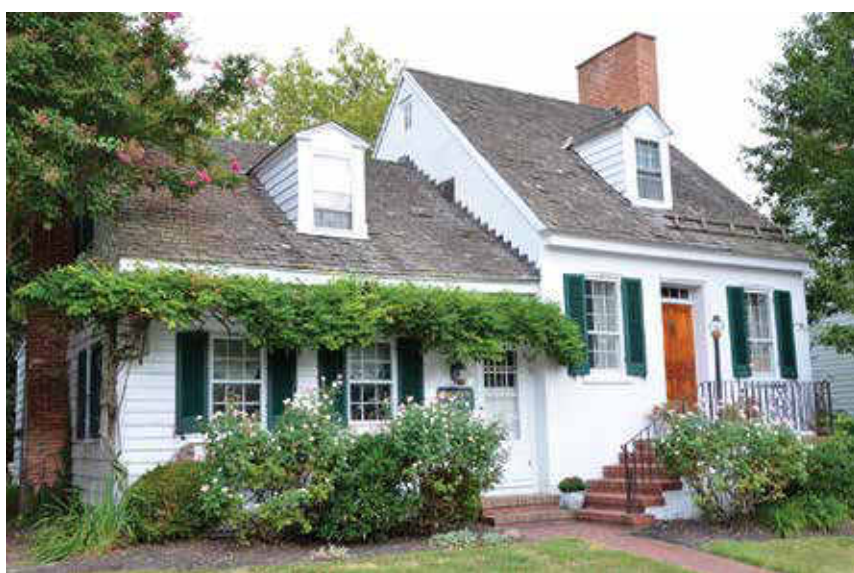
A typical historic home in St. Michaels (dating back to 1667)

of Annapolis, Wye Island is rife with bald eagles and great blue herons and also has the largest remaining tract of old growth forest on the Eastern Shore, “Schoolhouse Woods”.