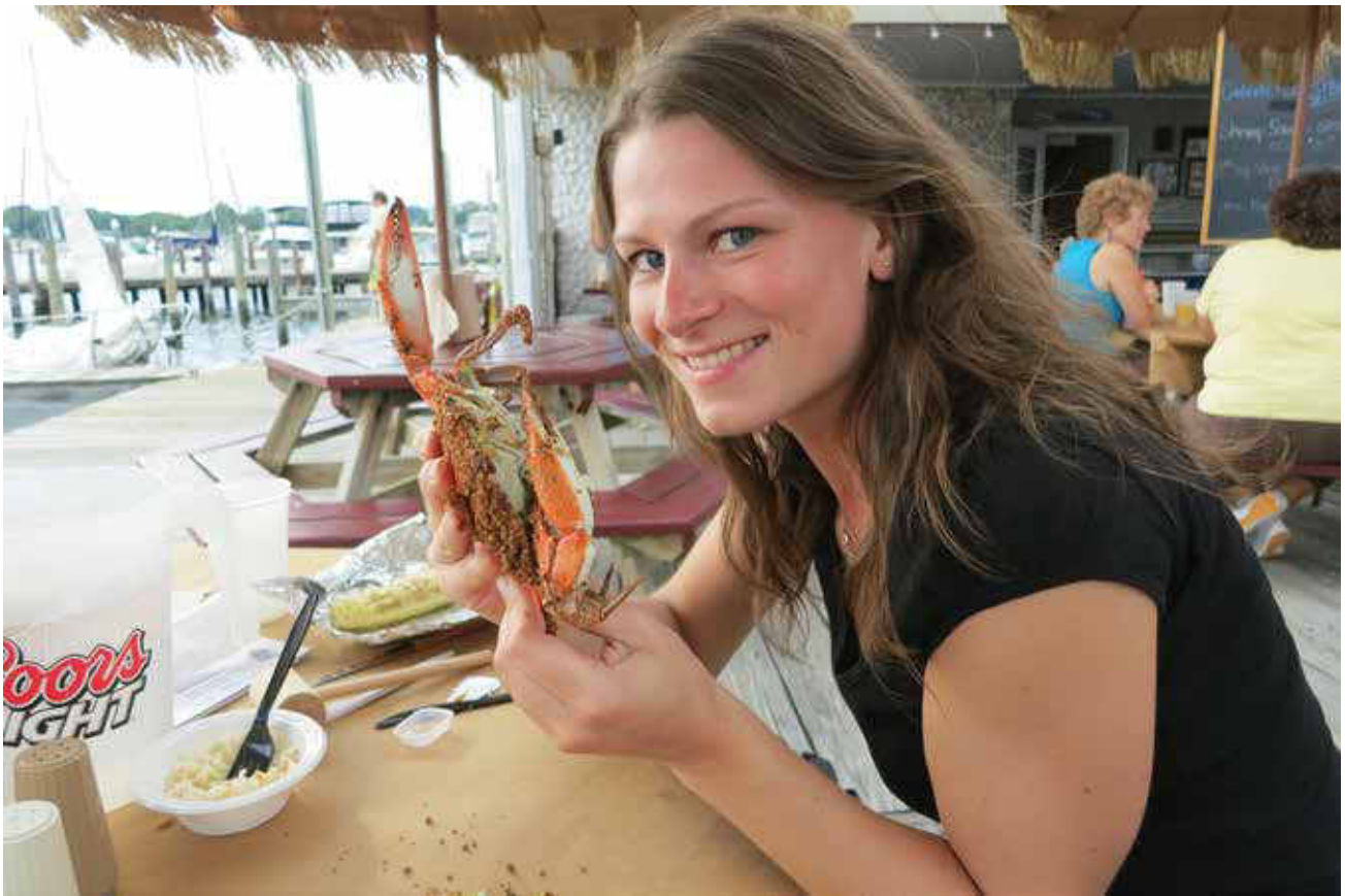
Opposite page; an osprey lands on a buoy on the Bay; this page; all you can eat crabs at Rock Hall, below, the author's boat on the Wye River

and a bucket of cold Natty Boh beer at one of the town's two famous waterfront bars, the Harbor Shack and Waterman's Crab House. However, if you want something a bit more eclectic, try Four Sirens, a high-end fusion burger joint in the heart of town that offers an awesome selection of craft IPAs.