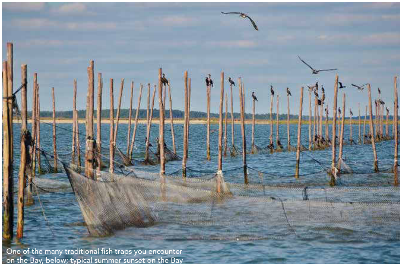
One of the many traditional fish traps you encounter on the Bay, below; typical summer sunset on the Bay

The former capital of the United States, Annapolis has no shortage of historic sites, including the Maryland Statehouse, the Governor's Mansion, and the Naval Academy. Or, you can spend a lazy afternoon meandering through the small turn-of-the-century maritime houses that make this such a picture-postcard town.