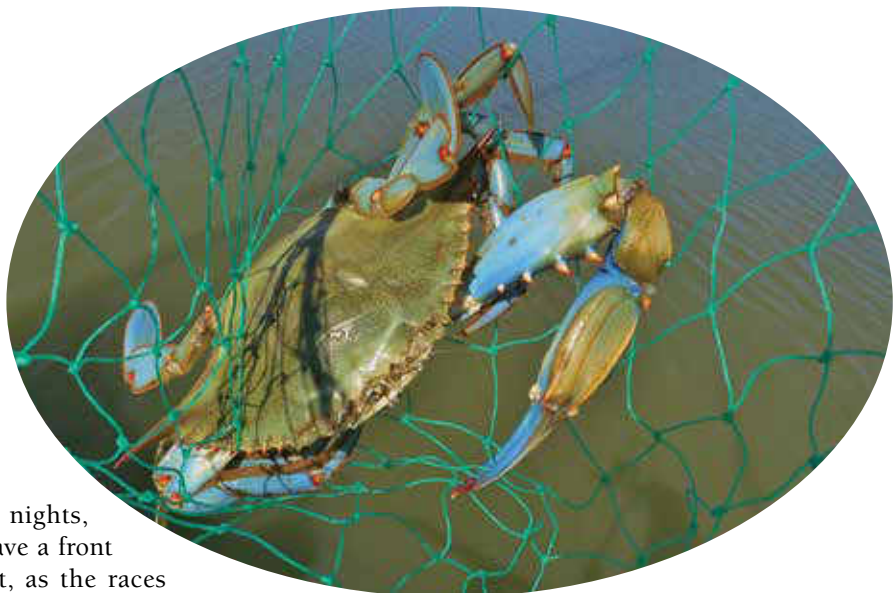
Above; Maryland Blue Crab we caught off the back off our boat; Maryland State House, Annapolis

If you need work done, Bert Jabin Yacht Yard is your best bet. It's not the cheapest place, but it's the most reliable; it's also one-stop shopping, as they have more sailing subcontractors in Jabin's yard than anywhere on the Bay. Annapolis is also your best bet for chartering. Dream Yacht Charter just opened a base here and has -a great selection of excellent, high-quality dependable boats.