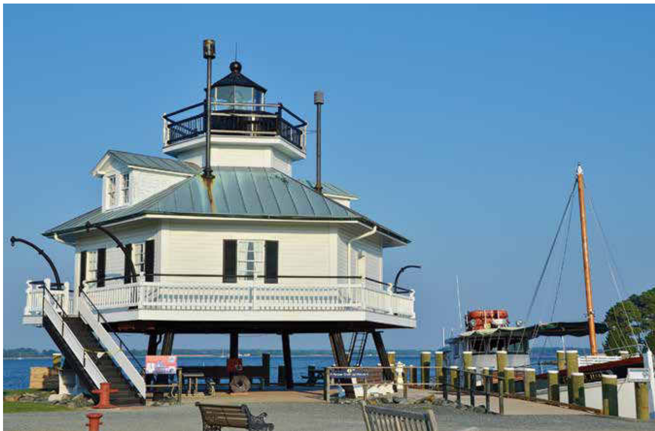
Hooper Strait Lighthouse at the Chesapeake Bay Maritime Museum